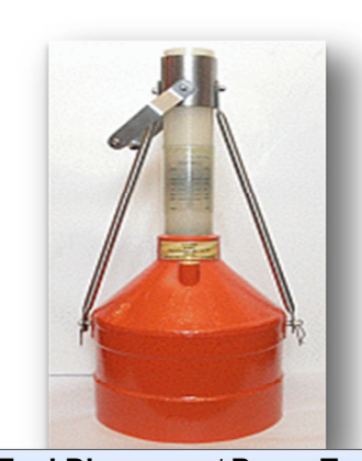
Fuel Dispenser / Pump Testing Measuring Device